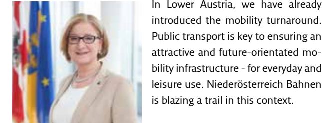
J. Mikl-Leitner Johanna Mikl-Leitner Governor of Lower Austria